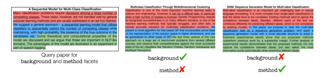
Figure 1: Examples of candidate papers similar along different facets for the same query paper, underlined text indicates similar aspects: A paper discussing a classification problem with large number of classes is similar along background with a paper discussing the same problem, but with a different paper discussing a sequential model for its method facet.

The promise of literature search to navigate vast collections of research documents offers exciting prospects and the potential to accelerate the process of scientific discovery [24]. This optimism has been expressed in a range of work in biomedicine [67], materials science [27], geography [42], biomimetic design [40], and machine learning [66]. The ever-growing research literature has also lead to search and recommendation tools being important in the workflows of individual researchers across a range of disciplines [43, 55]. However, few literature search and recommendation tools address the problem that documents often contain multiple fine grained aspects one might want to search with [53]. Further, prior work has also demonstrated that researchers often desire finer-grained control in literature search and exploration tools [18, 51, 28]. Context-dependent faceted search tools have the potential to fill this gap. Finally, while we focus on literature search, faceted QBE also has the potential to serve in other applications such as e-commerce search and product design [29].