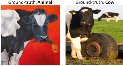
Figure 2: Example of inconsistent tagging in ImageNet-21K dataset. Two pictures containing the same animal were labeled differently.